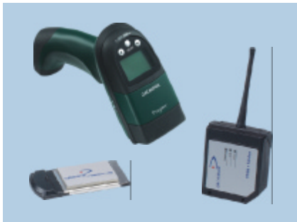
Dragon/DL Cordless Card/STAR Modem™